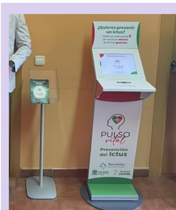
Pulso vital kiosk